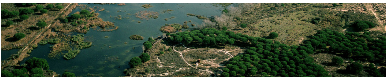
●● CENEAM Photo Library: J.M. Pérez de Ayala