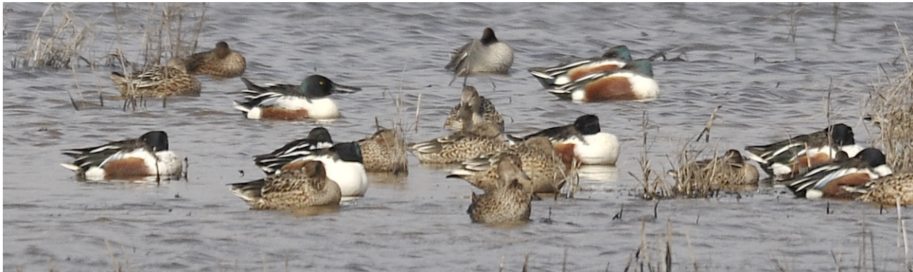
●● CENEAM Photo Library: J.M. Pérez de Ayala