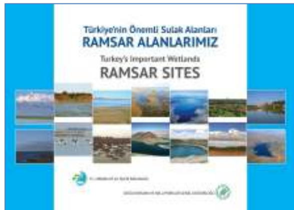
(Turkey’s Important Wetlands: RAMSAR SITES)

Some photos from Turkey’s wetlands (152 p.)