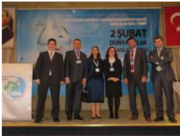
The Turkish Wetlands Team wishes you a Happy WWD 2013