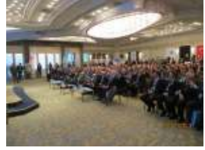
The speech of our Minister Mr. Prof. Veysel EROĞLU