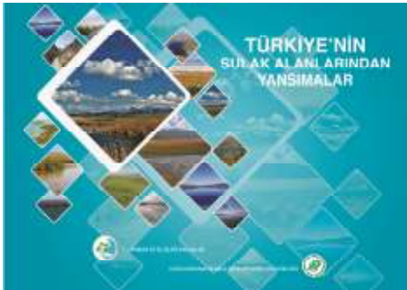
(Reflection from Turkey’s Wetlands)

Furthermore, MoFWA, GDNCNP Division of Wetlands produced interesting materials both for people and children. The book for Turkish Ramsar Sites (which also includes our new Ramsar site Nemrut Caldera) is published in Turkish and also in English. There is another book namely “The Reflection from Turkey’s Wetlands”. And there are 2 sets of Cards about Turkey’s Birds and Turkey’s Wetlands. These cards are especially for school children. There are 100 cards both in Turkey’s Birds and Turkey’s Wetlands.