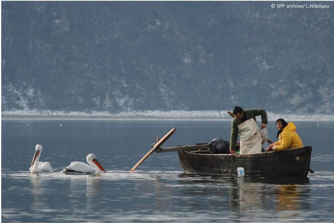
Lesser Prespa Lake from Greece to Albania